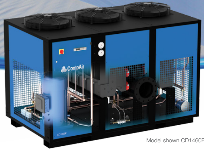
Model shown CD1460F