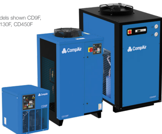
Models shown CD9F, CD130F, CD450F